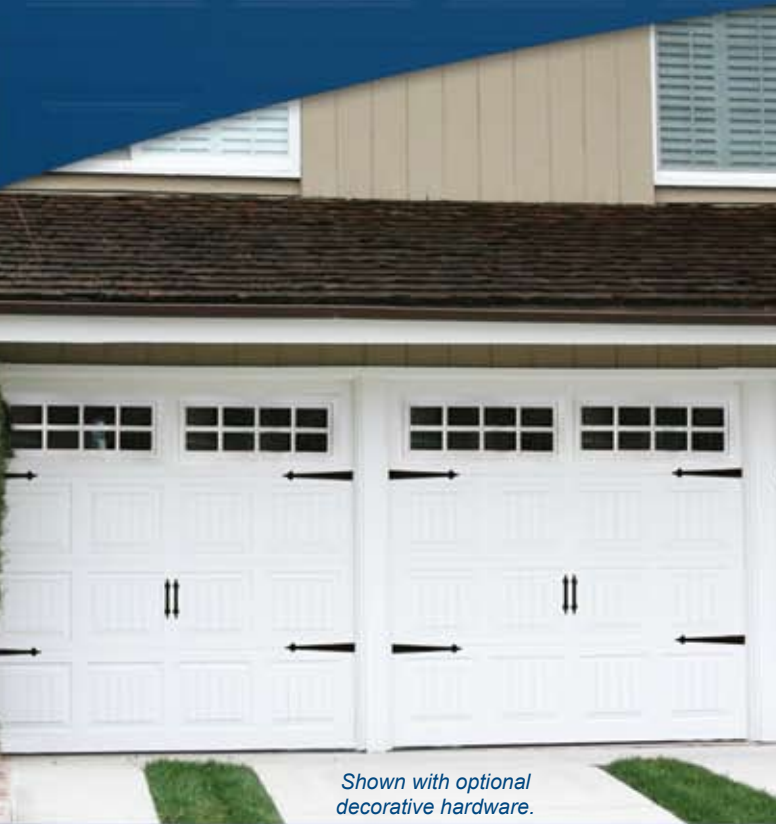
Shown with optional decorative hardware.